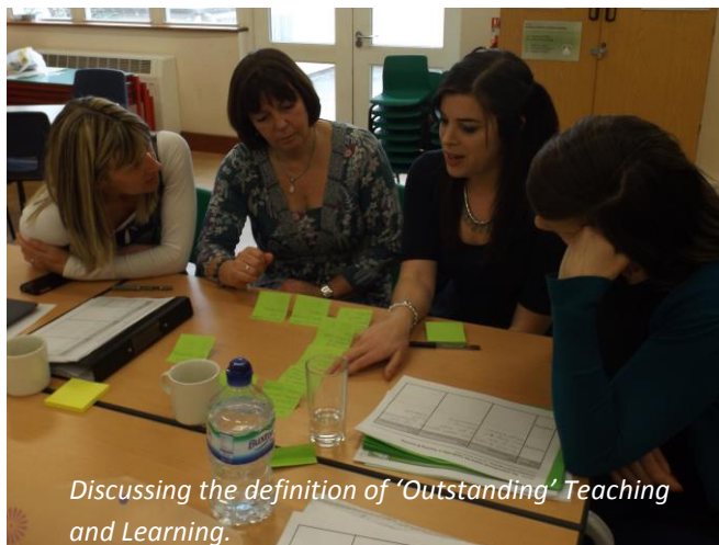
Discussing the definition of 'Outstanding' Teaching and Learning.

"This was a fantastic opportunity to network with other teachers and visit other schools. I have been able to take my learning back into my own school".